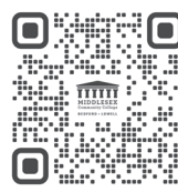
MCC Program List