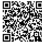
MCC Program List