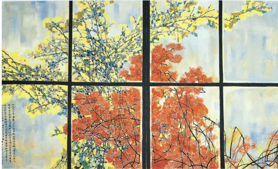
Huang Yongyu, Eternal Window , 1967. After being jailed, Huang was moved to a tiny shed near Beijing with no sunlight. In defiance, he painted this brightly colored window.

Monday March 5 th 9:30-10:45 Bedford East Cafe