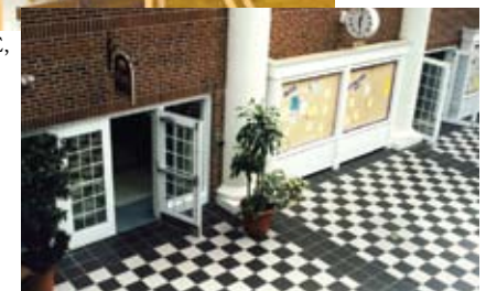
MAIN STREET, CAMPUS CENTER

Middlesex also has a campus in Lowell and owns two historic properties, The John Nesmith House in Lowell and The Middlesex Meetinghouse in Billerica, which also are available for rental. Call 976-656-3106 for details.