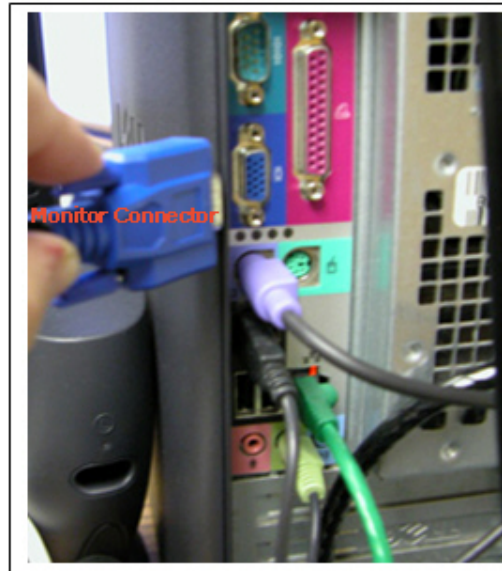
Back of instructor's PC to look the same or similar to the above photo.